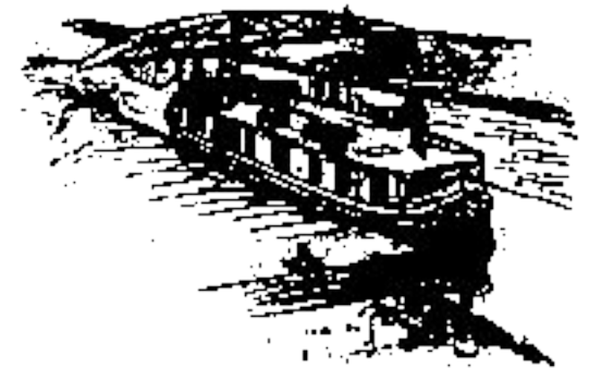
"On the banks of the Miami & Erie Canal"

Your help now could save all of us millions!